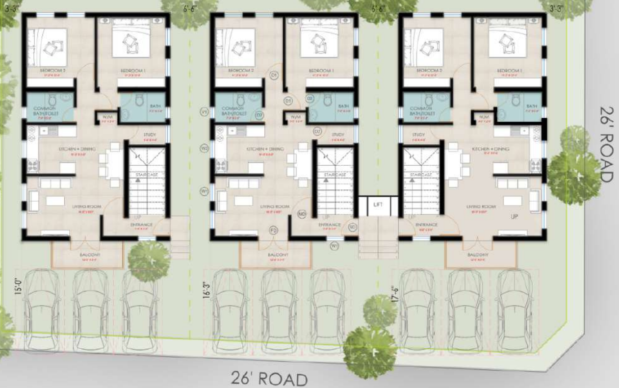
AUROMA HOMES PHASE 3 MASTER PLAN SHOWING LOCATION OF 3 INDEPENDENT VILLAS